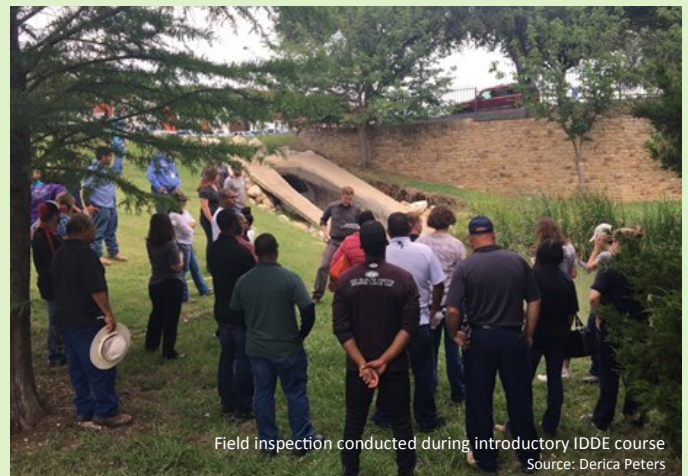
Field inspection conducted during introductory IDDE course

The intermediate/advanced course, presented by the City of Denton and the City of Arlington, also garnered a great deal of interest and filled to capacity. This training will be held every 2 years.