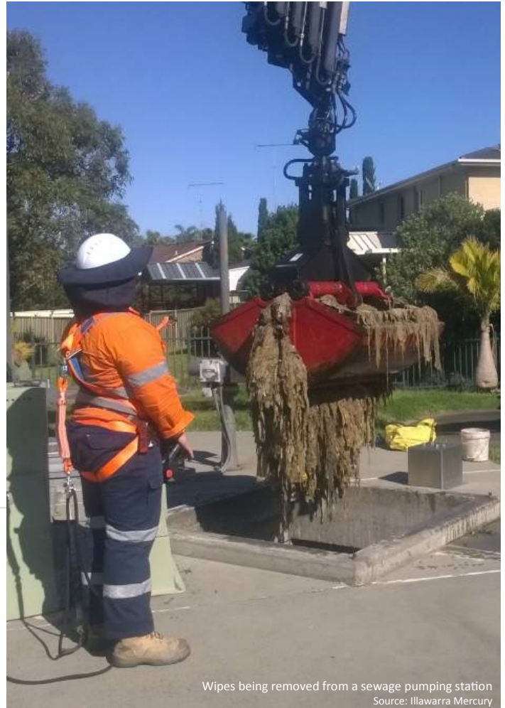
Wipes being removed from a sewage pumping station

For more information, visit Defend your Drains North Texas or contact Cassidy Campbell at CCampbell@nctcog.org .