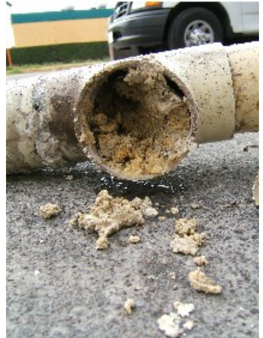
Pipe clogged with solidified grease buildup