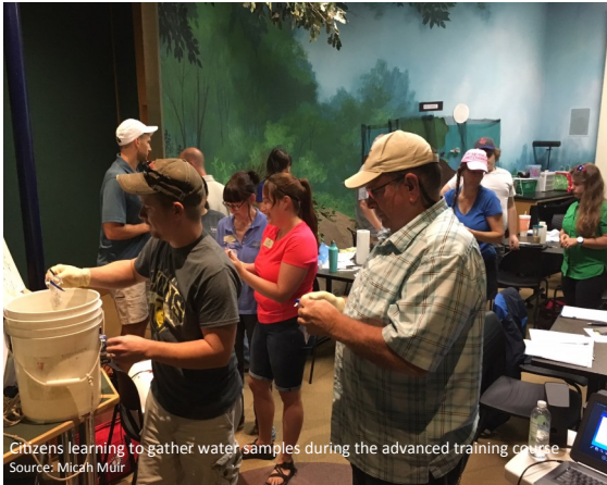
Citizens learning to gather water samples during the advanced training course.

The North Central Texas Council of Governments (NCTCOG) and the Texas Stream Team (TST) have partnered to expand the TST's Citizen Scientist program in the North Texas region.