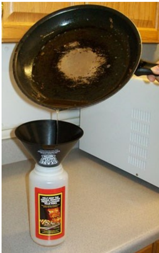
Proper disposal oil spent oil using a funnel and disposable bottle

Fats, oils, and grease (FOG) are considered to be the leading cause of blockages in sanitary sewers, and the EPA estimates that blockages account for nearly 50 percent of all Sanitary Sewer Overflows (SSOs) (US EPA,