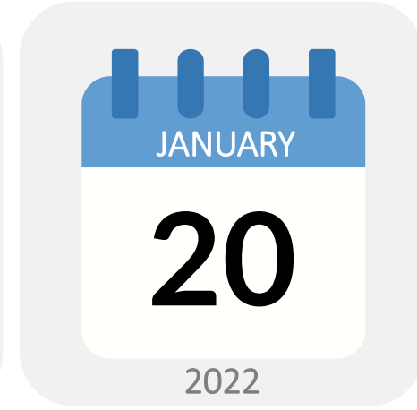
TMDL Stormwater Subcommittee Meeting