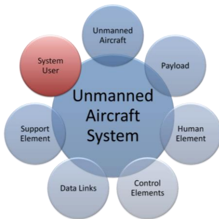
Exhibit 4: UAS Components

The term UAS encompasses an entire system of components (see Exhibit 4). The FAA makes use of the acronym to encompass all of the complex systems including ground stations and other elements besides the actual air vehicles. Since the capabilities of UAS are inherently contingent upon onboard equipment and payloads, UAS can vary greatly in terms of size and shape.