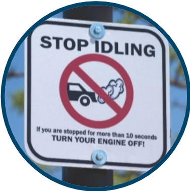
Idle Reduction Measures and Fuel Economy Improvements