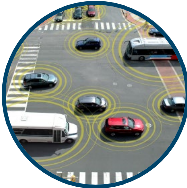
New Mobility Choices and Emerging Transportation Technologies