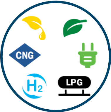
Alternative and Renewable Fuels and Infrastructure