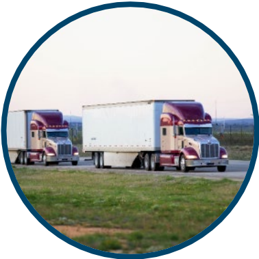
Light-, Medium-, and Heavy-Duty Vehicles