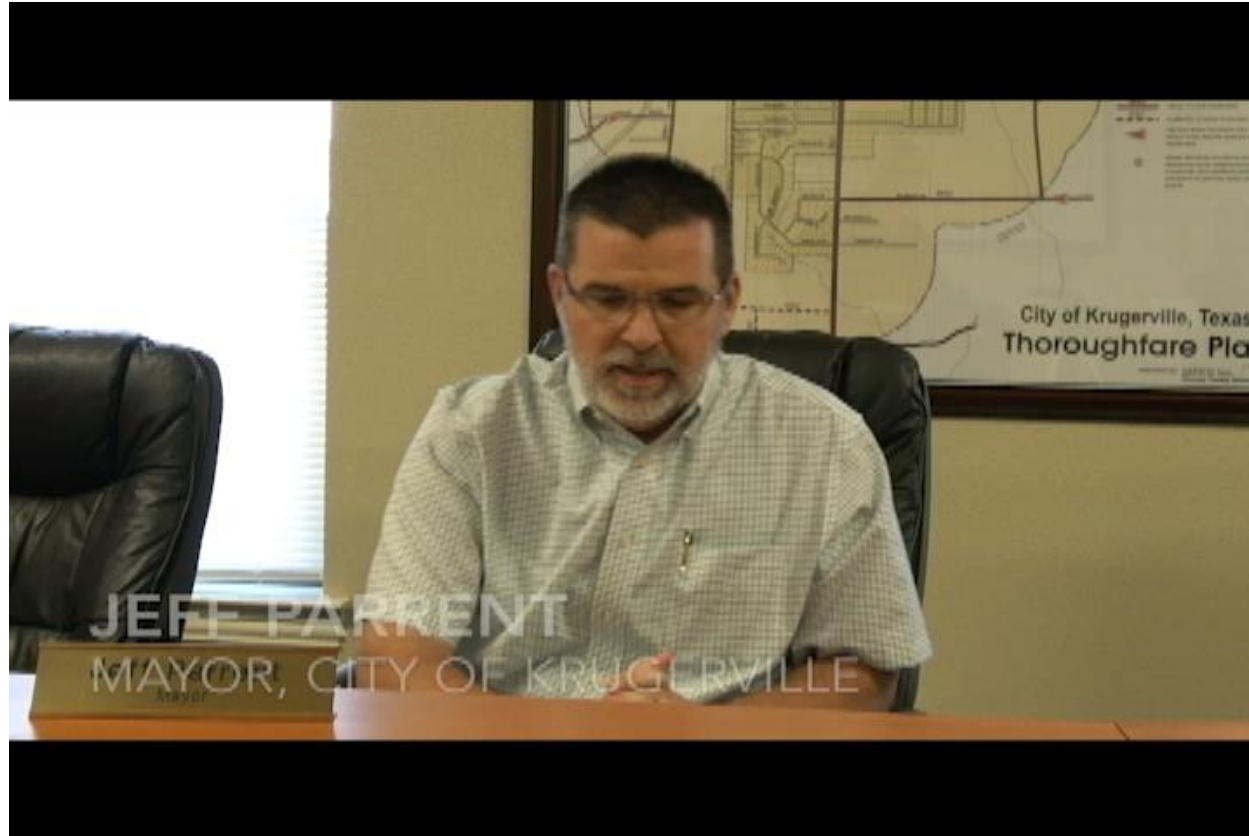
JEFF PARRENT MAYOR, CITY OF KRUGERVILLE