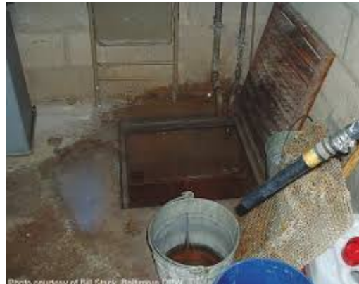
A common industrial cross connection is a floor drain that is illicitly connected to a storm drain