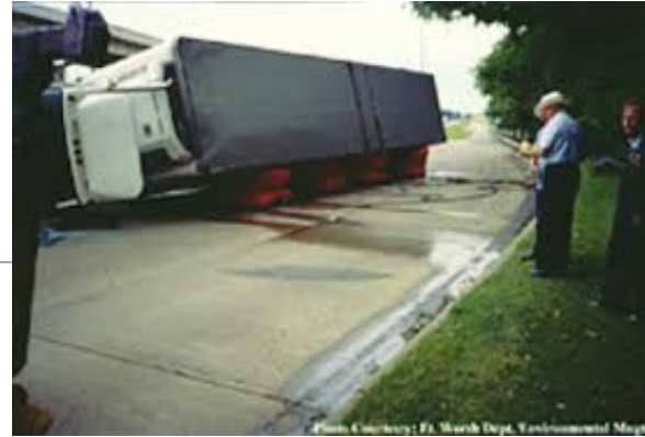
Vehicle fluid release from an accident