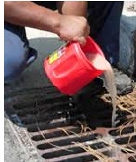
Outdoor washing activities