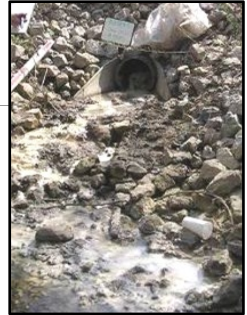
Construction site concrete washout wash- water