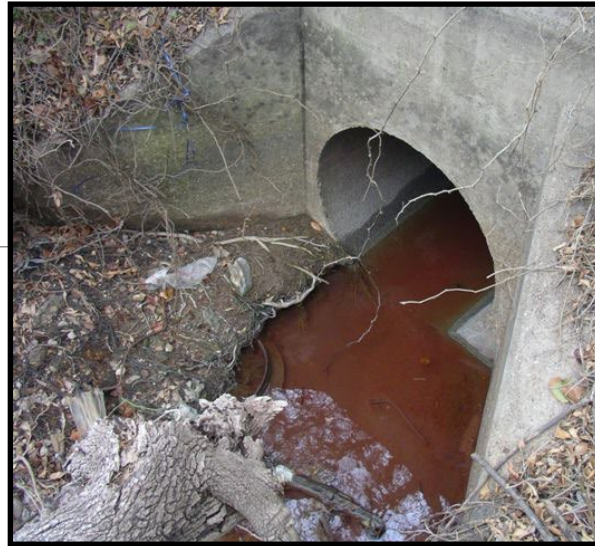
Tracer dye wash-water from industrial site