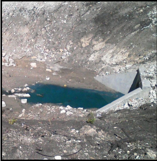
Runoff from hydro mulching or landscape/ planting activity