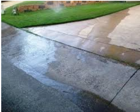
Outdoor washing activities