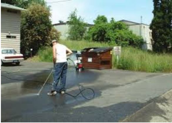
Routine outdoor washing or rinsing