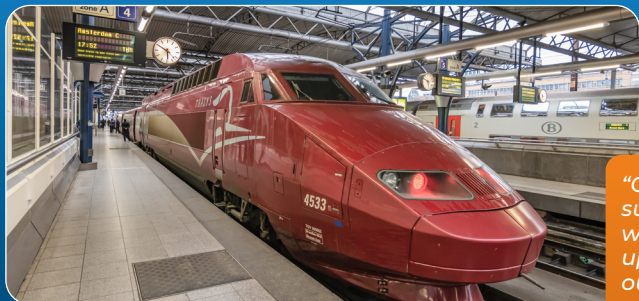
Existing High-Speed Rail – Europe

“Collaboration is critical for our success. Please visit our website at www.nctcog.org/dfw-hstcs to keep up with the study and participate in our community meetings.”