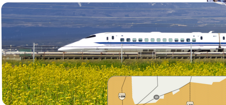
Examples of Existing High-Speed Rail – Asia

After initial design plans are completed by early fall, NCTCOG will begin documentation for the National Environmental Policy Act (NEPA) process, a federal requirement for assessing the project's potential effects on the community and natural environment. Learn more about NEPA on page 3.