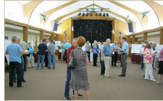
Open House at the River Oaks Community Center