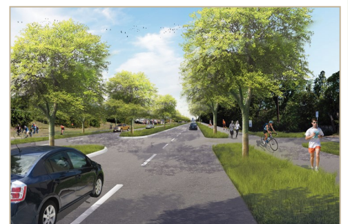
SH 199 Design Concept