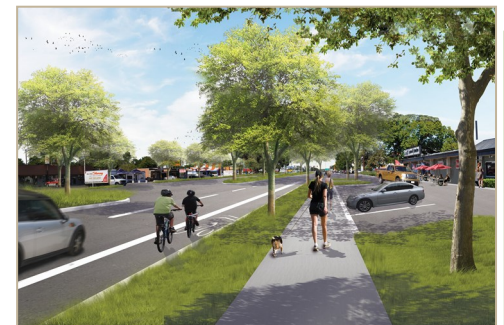
SH 183 Design Concept