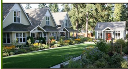
Cottage Housing Concept

ALIGN LAND USE, ZONING, AND SUBDIVISION REGULATIONS TO GUIDE QUALITY GROWTH, EMPHASIZING WALKABLE COMMUNITIES WITH HOUSING OPTIONS, ATTRACTIVE AND COMMERCIAL MIXED-USE CORRIDORS, AND TOWN CENTERS