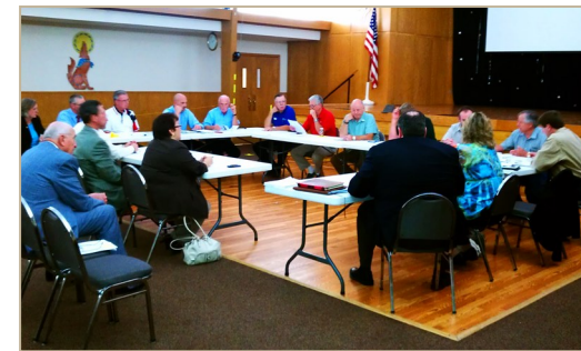
Roundtable Discussion with Mayors, Elected Officials and City Managers