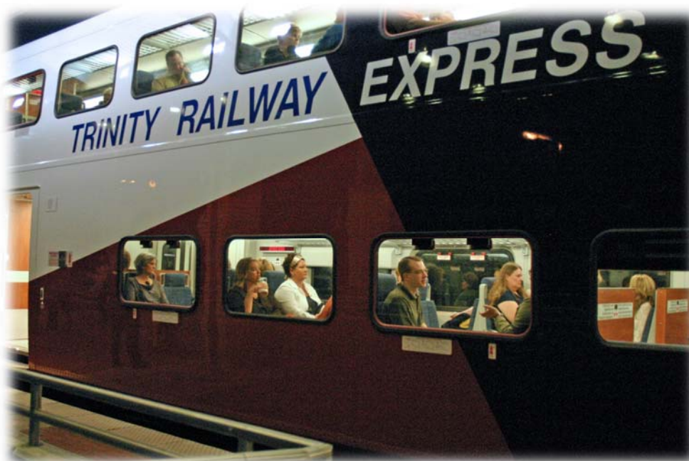
The TRE carries commuters between Dallas Reunion Station and Fort Worth Intermodal Transportation Center.

transportation funding programs. The North Central Texas Council of Governments (NCTCOG) and the Regional Transportation Council (RTC), as the MPO for the Dallas-Fort Worth-Arlington Urbanized Area, the Denton-Lewisville Urbanized Area, and the McKinney Urbanized Area, is assigned project-level programming responsibilities for funding programs that focus on achieving the regional mobility and air quality objectives of the Metropolitan Area. The Texas Department of Transportation (TxDOT) continues to select projects that focus on maintaining and improving the State and National Highway System both in areas outside and within the metropolitan area. Exhibits III-1 and III-2 illustrate the agencies responsible for selecting projects for each of the State and federal funding programs listed in the TIP.