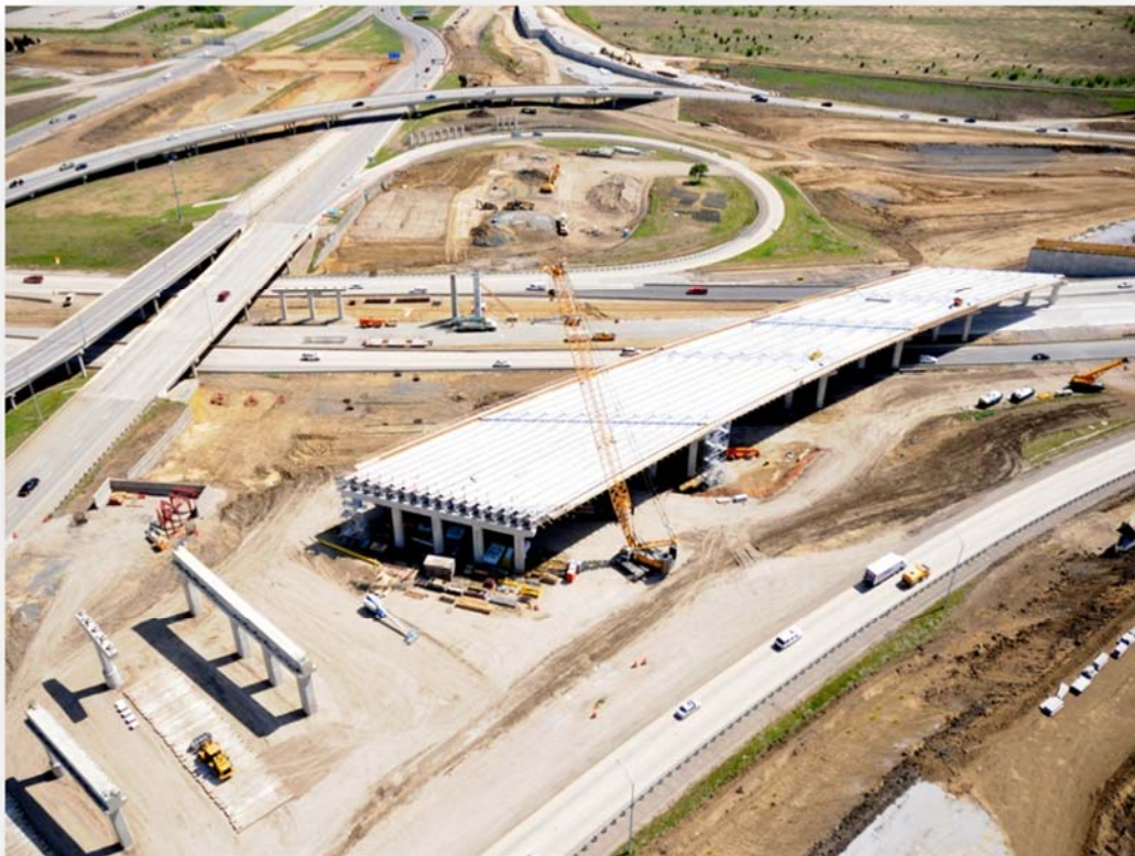
DFW Connector

Participation Plan. All modifications that require a revision to the Statewide Transportation Improvement Program (STIP) are submitted to TxDOT on a quarterly basis.