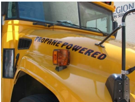
School buses retrofitted to run on Propane.