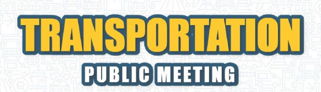
Exhibit II-1. Transportation Public Meeting Flyer for May 2024

MAY 13 · NOON · 616 SIX FLAGS DR. ARLINGTON.TX 76011