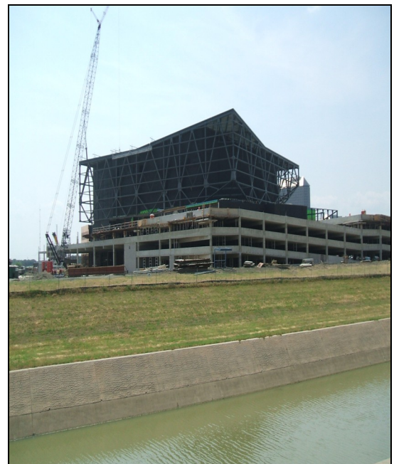
Las Colinas Convention Center