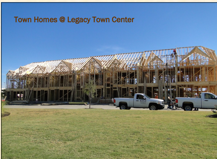
Town Homes @ Legacy Town Center

Construction continues on sections of Hwy 121 (Sam Rayburn Tollway). One section that runs through Legacy Park that's under construction is the SRT/Dallas North Tollway interchange. This project is expected to complete in January of 2012.