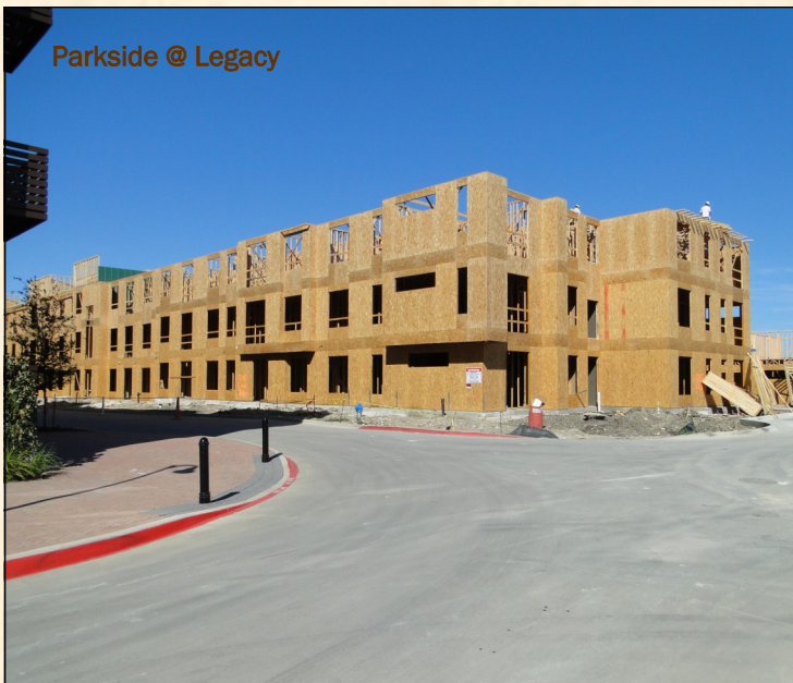
Parkside @ Legacy

Also, construction continues on The Townhomes @ Legacy Town Center. Located at the corner of Knox Dr and Presley Ave, the phase currently under construction will have 170 total units when complete. Legacy has a nice mix of town homes and apartments that complement each other to go along with the commercial development taking place.