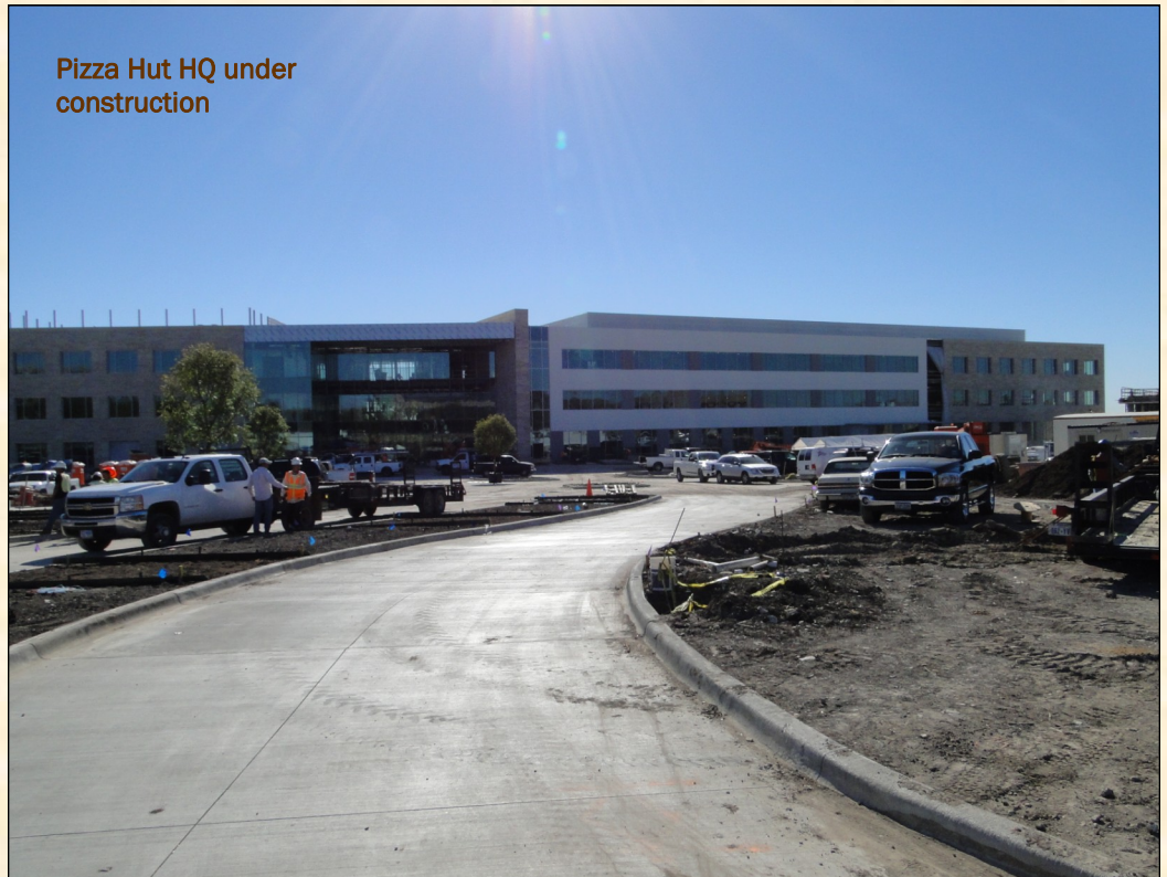
Pizza Hut HQ under construction

Legacy Park is a 2,600 acre commercial/residential development and is home to such companies as JC Penney, Frito Lay, Cadbury Schweppes, & Hewlett Packard/EDS as well as numerous other companies.