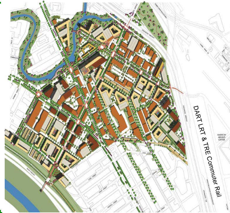
2025 MASTER PLAN – DALLAS DESIGN DISTRICT TIF DISTRICT