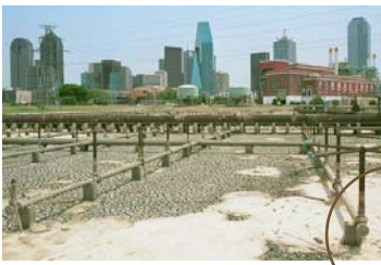
American Airlines Center