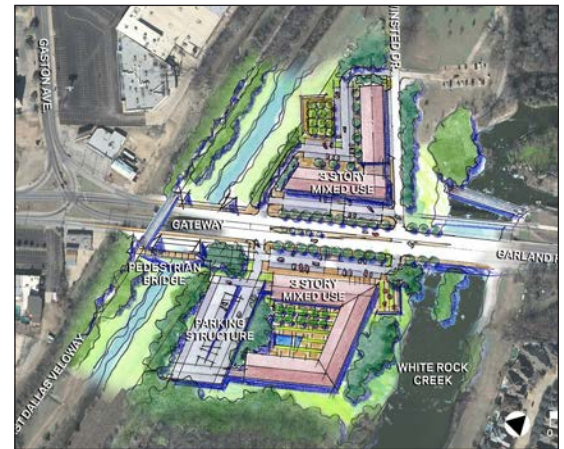
Strategic Opportunity Area 1 Vision