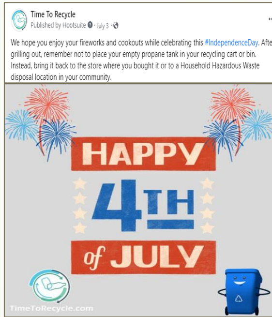
Most Impressions & Engagements