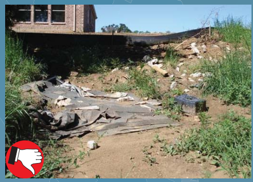
Debris and trash are not being managed through appropriate practices. Disposal receptacles and education about proper use must be provided.