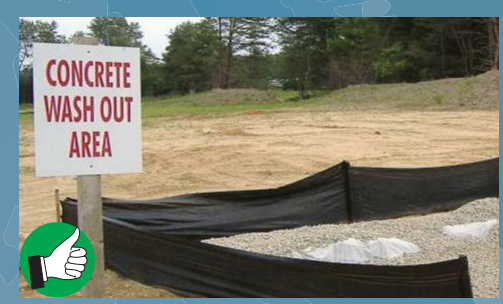
Signage is used properly to identify the concrete washout area.

Concrete washouts are used to contain concrete and liquids when the chutes of concrete mixers and hoppers of concrete pumps are rinsed out after delivery. The washout facilities consolidate solids for easier disposal and prevent runoff of liquids. Concrete washouts may consist of an approved build structure or a prefabricated container.