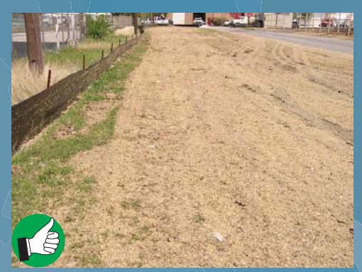
Mulch is applied with seeding for final stabilization.

Mulching is the application of a uniform layer of organic material over barren areas to reduce the effects of erosion from rainfall. Types of mulch include compost mixtures, straw, wood chips, bark, or other fibers.