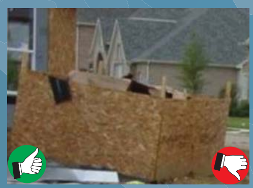
Good use of disposal receptacle; however, it is nearly full and should be emptied and disposed of properly. Materials should be recycled where possible.

Large volumes of debris and trash are often generated at construction sites, including packaging, pallets, wood waste, personal trash, scrap material, and a variety of other wastes. The objective of debris and trash management is to minimize the potential of stormwater contamination from solid waste through appropriate storage and disposal practices. Construction debris recycling is encouraged to reduce the volume of material to be disposed of and associated costs of disposal.