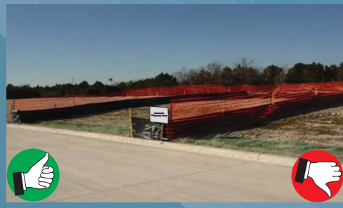
Silt fence, orange fence, and signage are appropriately used to manage concrete waste; however, rock should be placed at the entrance to prevent offsite tracking.