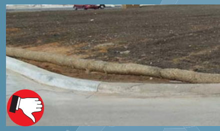
Inadequate organic filter tubes to protect this area of exposed soil; additional BMPs are needed. Tubes need to be re-aligned at the curb and appropriately embedded into the soil.