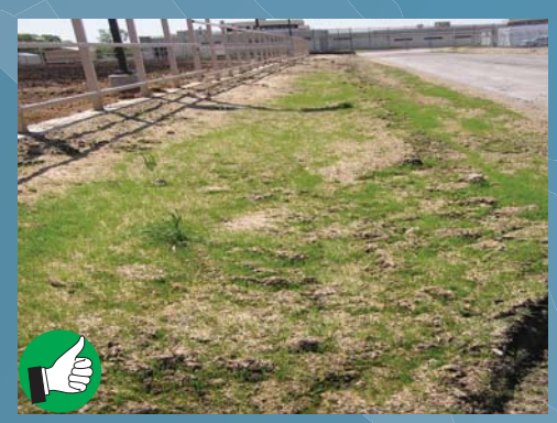
Mulch is applied to reduce sediment runoff. Mulch needs to be applied regularly in high traffic areas to maintain uniform thickness.