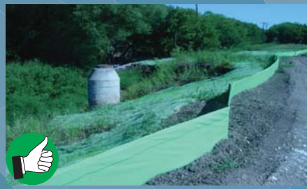
Silt fence is properly installed and is used to reduce runoff velocity and filter sediment before exiting site.

A silt fence consists of geotextile fabric supported by wire mesh netting or other backing stretched between metal posts with the lower edge of the fabric securely embedded six inches in the soil. The fence is typically located downstream of disturbed areas to intercept runoff in the form of sheet flow. A silt fence provides both filtration and time for sediment settling by reducing the velocity of the runoff.