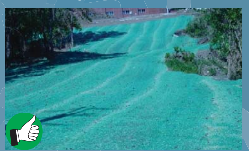
Excellent slope protection. ECBs are correctly installed on this long slope (vertically) and should be installed horizontally on short slopes.

Erosion control blankets (ECBs) are temporary, degradable, rolled erosion control products that reduce soil erosion and assist in the establishment and growth of vegetation. ECBs, also known as soil retention blankets, are composed primarily of processed, natural, or organic materials that are woven, glued, or structurally bound together with natural fiber netting or mesh on one or both sides.