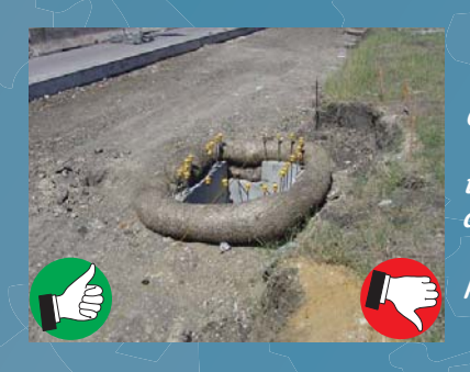
Good application of organic filter tubes to protect the storm drain; however, they are not staked or properly embedded in the soil.