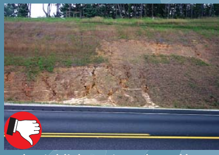
Poor seed establishment on slope. Use seeding in combination with other BMPs (e.g. erosion control blankets) when slopes are steep.