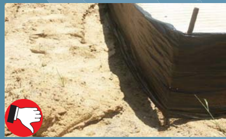
Silt fence is not properly trenched. The lower edge of the fabric must be securely embedded 6 inches in soil.