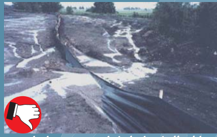
Silt fence is inappropriately installed in an area subject to concentrated flows. A check dam would be more suitable here. There is no wire mesh backing to reinforce the silt fence and wood posts are being used instead of metal.