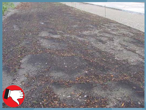
Mulch was applied in an area of concentrated flow and is washing away. Mulch should be applied evenly and uniformly and at an appropriate thickness.