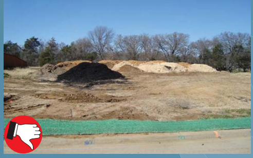
Inadequate ECB to protect this area of exposed soil; additional BMPs are needed. ECB is not trenched or anchored correctly as indicated by sediment at the curb. Spoil piles should also be better protected.