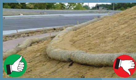
Appropriate use of a series of organic filter tubes to protect a slope; however, accumulated sediment must be removed.