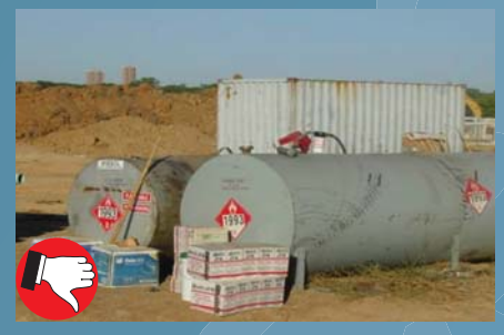
Inappropriate management of chemicals and other hazardous materials. Gas tanks need secondary containment that is 110 percent of the container. Other chemicals should be stored in an appropriate enclosure to minimize potential of stormwater contamination.