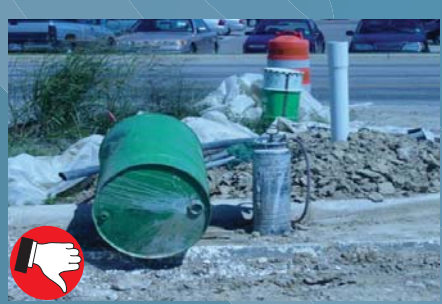
Chemical storage container is inappropriately discarded, and there is evidence of a spill. Chemicals should be properly stored and disposed of and spills cleaned up immediately.