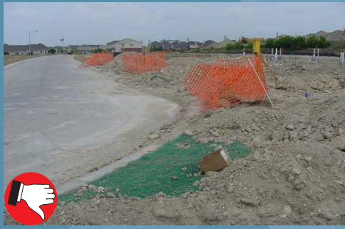
Piles of sediment are inappropriately placed on top of ECBs in the process of digging for utility/water lines.