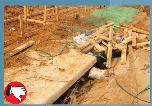
Debris and trash nearly clogging the storm drain is one of many problems with this picture. Trash receptacles should be placed throughout the site and a trash management education and awareness program should be implemented.