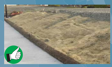
Organic filter tubes are used with other BMPs to protect an area that may prevent the embedment of other controls.

Organic filter tubes are comprised of an open weave, mesh tube that is filled with a filter material (compost, wood chips, straw, coir, aspen fiber, or a mixture of materials). The tube may be constructed of geosynthetic material, plastic, or natural materials. Organic filter tubes are also called wattles, fiber rolls, fiber logs, mulch socks, and/ or coir rolls. Filter tubes detain flow and capture sediment as linear controls along the contours of a slope or as a perimeter control down-slope of a disturbed area.