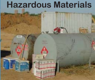
About this Guide

This guide is intended to equip the construction site superintendent with the knowledge and resources necessary to help keep the site compliant and protect water quality from stormwater pollution due to soil loss and mismanagement of materials and waste. It provides basic information of common BMPs used at construction sites related to: