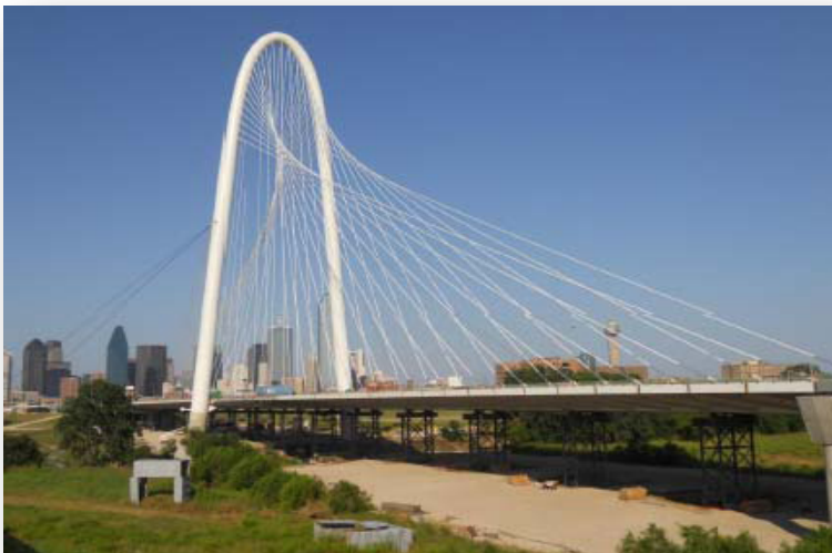
Margaret H. Hunt Bridge, Dallas

In nonattainment areas, single occupant vehicle (SOV) capacity improvements must be included in a congestion management system. In addition, the resulting SOV projects must utilize management strategies such as travel demand reduction and operational management strategies as appropriate for the corridor. Projects that have advanced beyond the National Environmental Policy Act (NEPA) stage prior to April 6, 1992, and which are actively advancing to implementation, are not subject to this provision. Additional information on the CMP is provided in Appendix E.