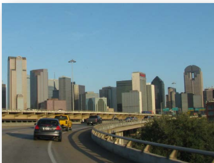
Dallas Skyline, 2009

Register as required by the Safe, Accountable, Flexible, Efficient Transportation Equity Act: A Legacy for Users (SAFETEA-LU). The 2013-2016 TIP was prepared under guidelines set forth in the Code of Federal Regulations (referenced above) as updated on June 9, 2006, and in SAFETEA-LU.