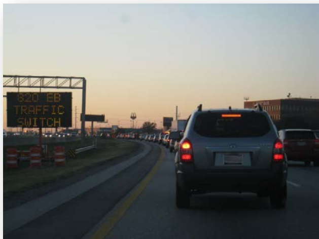
IH 820 Construction North Richland Hills

The Unified Transportation Program (UTP) is TxDOT's 10-year planning document that guides the planning and development of each TxDOT District's transportation improvements. The North Central Texas area includes three TxDOT District Offices: the Dallas District, Fort Worth District, and the Paris District. Planning rules require that the TIP be constrained by available financial resources in the first four years, while TxDOT, based on State law, programs the UTP over 10 years. Hence, the UTP may contain additional projects beyond those included in the TIP. The TxDOT Dallas, TxDOT Fort Worth, and TxDOT Paris sections of the 2010 UTP are available through the TxDOT Districts and on the TxDOT website. In order for any of these additional projects to move forward into the programming and construction stages, they must be included in the TIP and, subsequently, the Statewide Transportation Improvement Program (STIP).