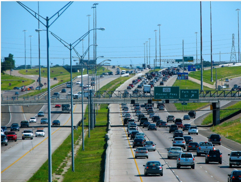
SH 360 Arlington

Federal regulations mandate that the metropolitan transportation planning process must include development of a TIP for the metropolitan planning area by the MPO in cooperation with the state department of transportation, local governments, and public transportation authorities. Specific requirements of the TIP and a brief discussion of how NCTCOG complied with these requirements are outlined below.