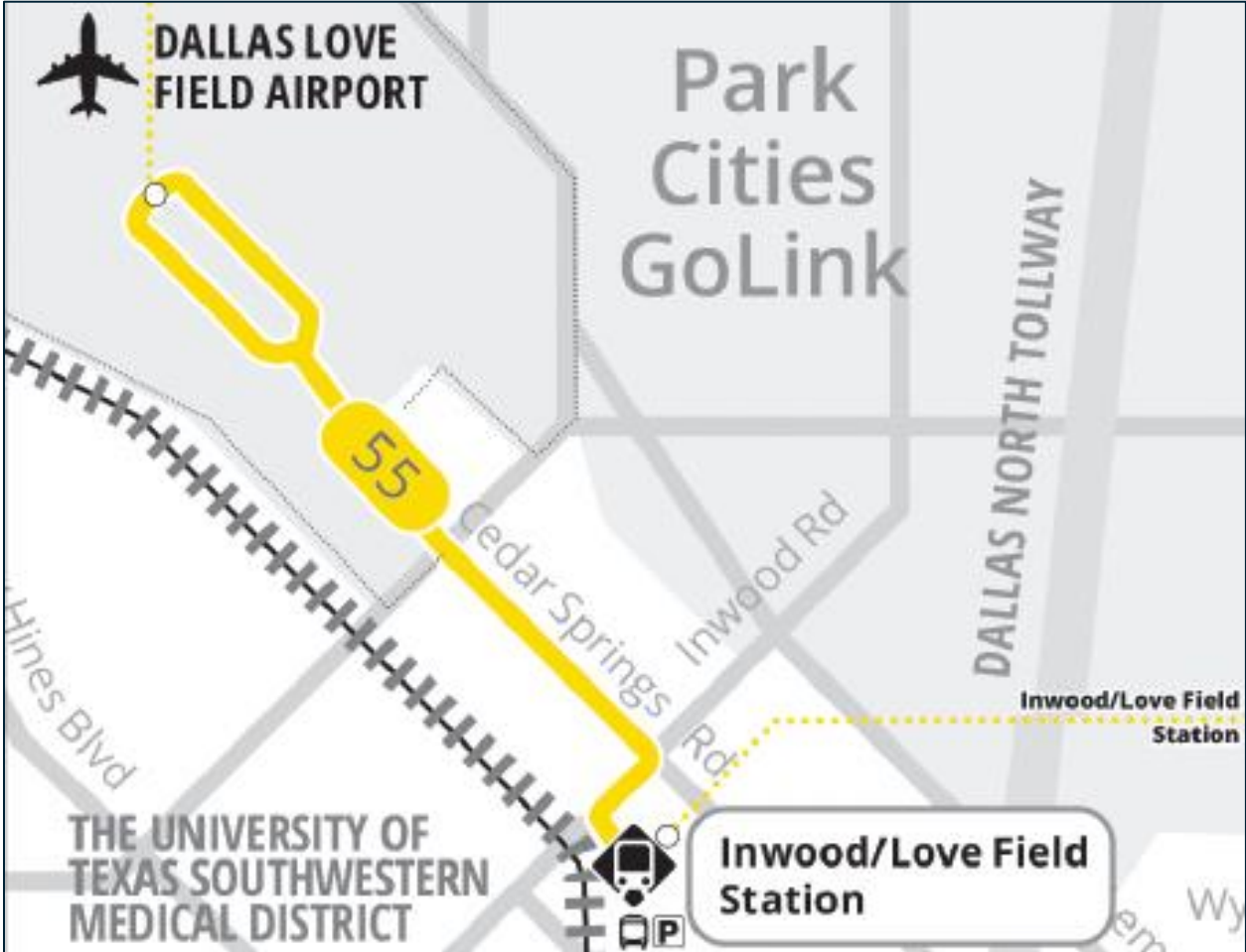
Figure 2: Love Link Route

Figure 2 displays the Love Link route from Inwood/Love Field Station to the Love Field Airport terminal.