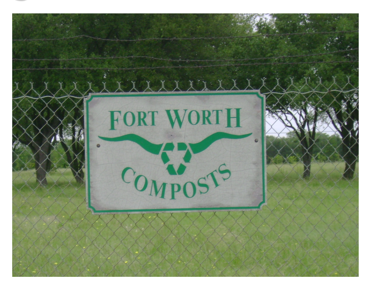
Mulch vs. Compost