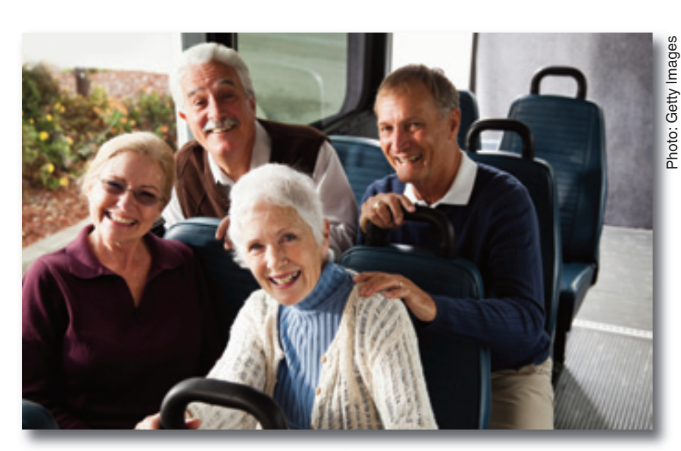
Community input will help NCTCOG enhance Access North Texas to provide better transportation services for those in need throughout the 16-county region.

Interactive outreach meetings will be held across the 16-county North Central Texas Council of Governments region to provide stakeholders an opportunity to provide feedback on public transportation needs in their communities.