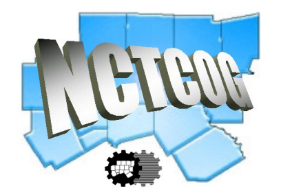
North Central Texas Council of Governments