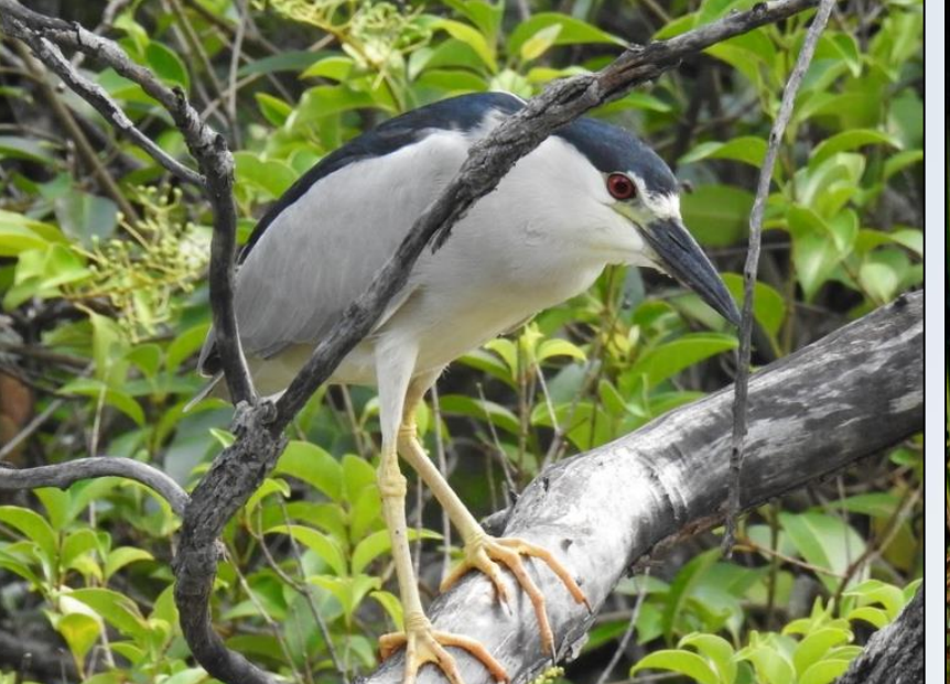
Black-crowned Night Heron