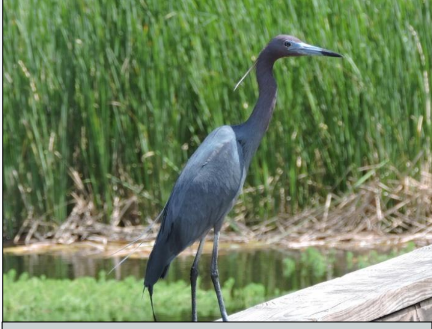
Little Blue Heron