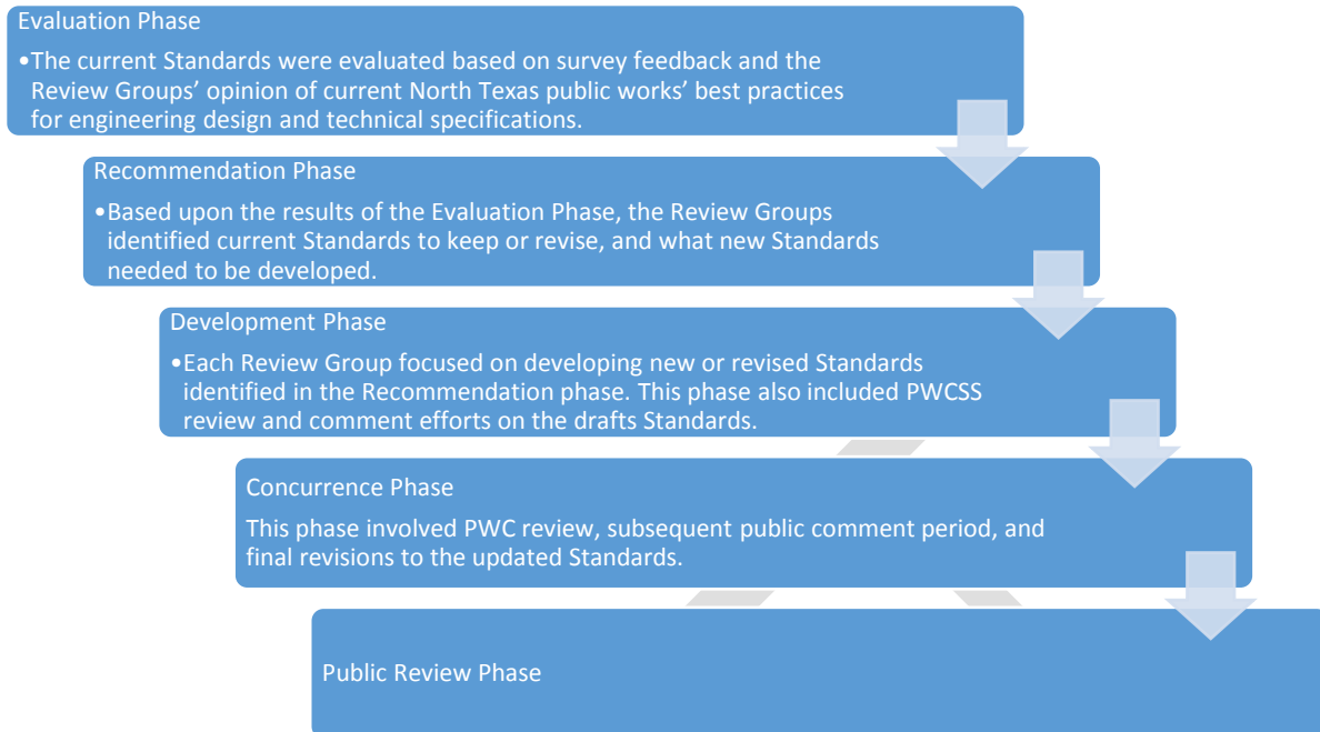
Exhibit 1: Fifth Edition Public Works Construction Standards Update Phases

The Public Works Council fully endorsed the Final Draft 2017 Fifth Edition Public Works Construction Standards in August 2017. The NCTCOG Executive Board subsequently endorsed and approved the Final 2017 Fifth Edition in September 2017. NCTCOG will provide information and outreach to local governments as a result of the release of the Fifth Edition.