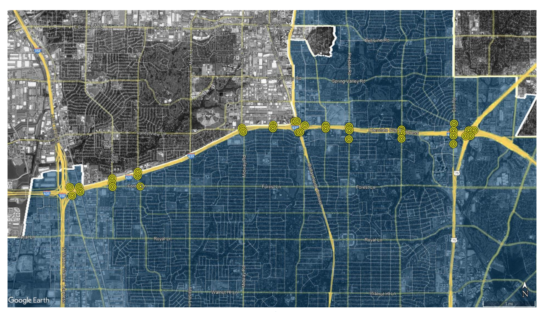
Figure 1. IH 635 Corridor