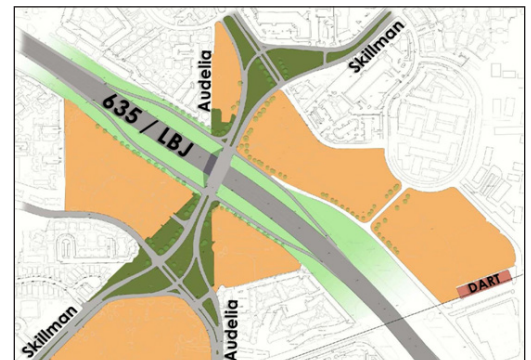
Existing Skillman Street Alignment