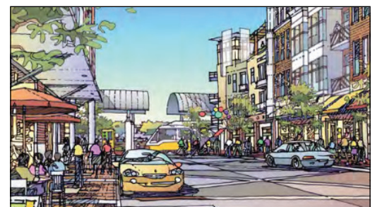
TOD Concept Adjacent to DART Station