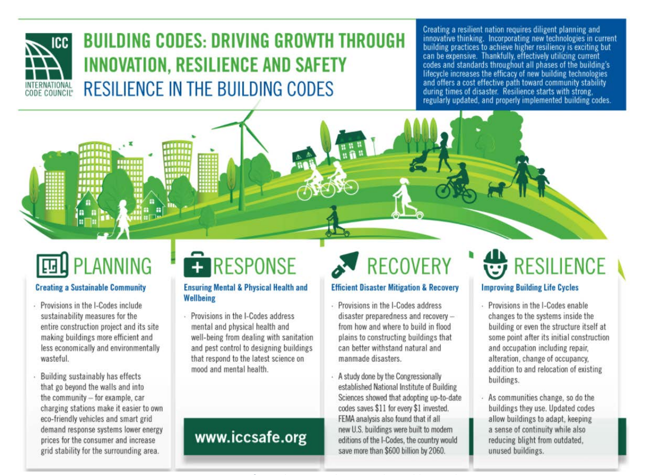
Figure 2. ICC Infographic on Resilience in The Building Codes

Recognizing that "resilience starts with strong, regularly updated, and properly implemented building codes", the ICC has created a <u>Resiliency Toolkit</u> which underscores the role of codes in being a good first step towards creating resiliency<sup>v</sup>. Users of the toolkit will learn how provisions in the I-Codes include sustainability measures which make buildings more efficient and less wasteful; address disaster preparedness and recovery; and enable changes to the systems within the building or the structure itself post construction and occupancy. The toolkit includes content such as graphics, studies, reports, and other resources for anyone looking to learn more about resiliency of the built environment.