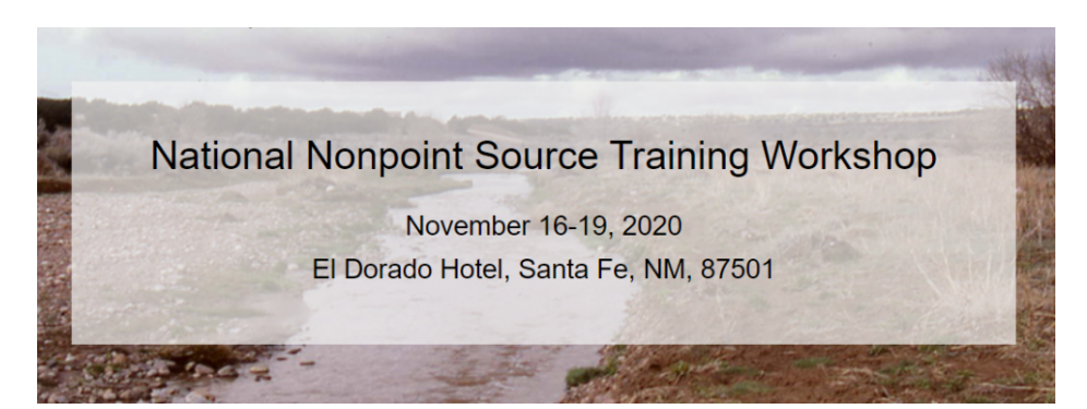
Save the Date! 2020 National Nonpoint Source (NPS) Training Workshop

The U.S. EPA Nonpoint Source Management Branch along with U.S. EPA Region 6 will host the 2020 National Nonpoint Source Training Workshop at the El Dorado Hotel in Santa Fe,