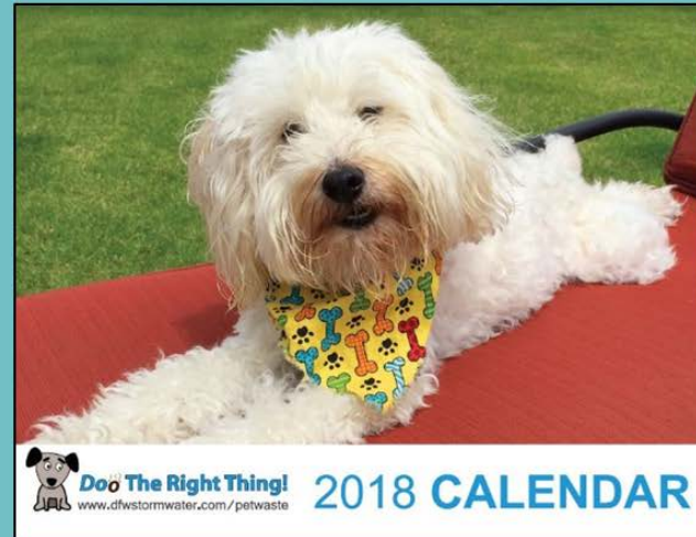
(Toby, 2018 Cover Dog)

Do you think your dog is calendar worthy? Pledge to Doo the Right Thing and your dog may be featured in the 2019 calendar!