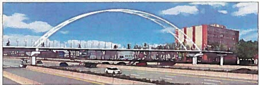
Preliminary rendering of the Northaven Trail Bridge over US 75.