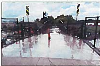
Photo 1: The Santa Fe Trail bridge over US-75 re-opened in early September 2022.

Over the summer, the Santa Fe Trail bridge over the highway was closed and temporarily detoured while work