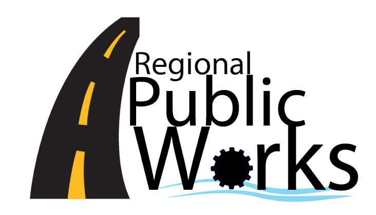
Seeking input from NCTCOG Public Works Council on stormwater infrastructure data