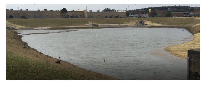
smart ponds