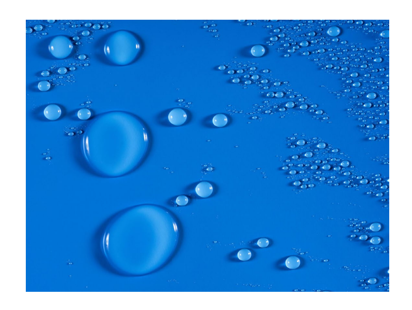
Identified two experts in aquifer recharge