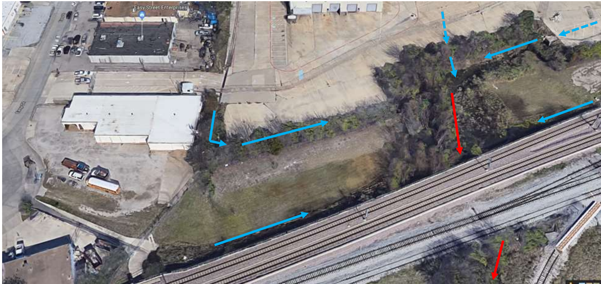
Sheen flowing from north to south. Various outfalls combine and continue south, under the track ROW.