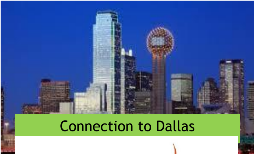
Connection to Dallas